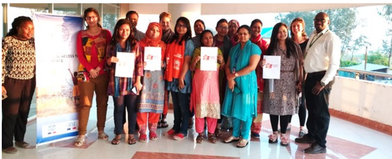
MdM Training Session

Another small funding has been granted by the Mairie de Paris (French donor - 30K€) to cover a project in Cox's Bazar, in partnership with Community Partners International (CPI) and the Hope Foundation.