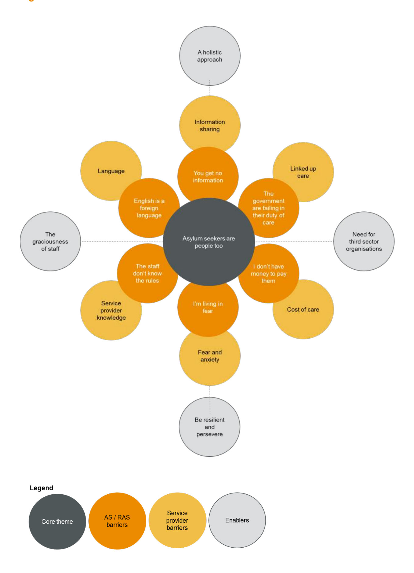
Figure 2 Main themes